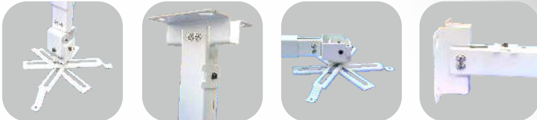
3 Strip Projector Mounting design for maximum adjustment

http://www.supersystem.co.in/projector-mount-deluxe-ceiling