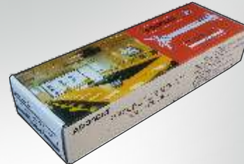
New Attractive Box Pack